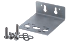
-K DP- wall bracket CODE RB7400021